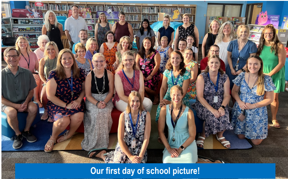
Our first day of school picture!

Welcome back! We are very excited to see your children today! We especially want to welcome all new families and staff members to our community! We are overjoyed to begin this journey with your family. We are honored to have the opportunity to get to know and love your children!